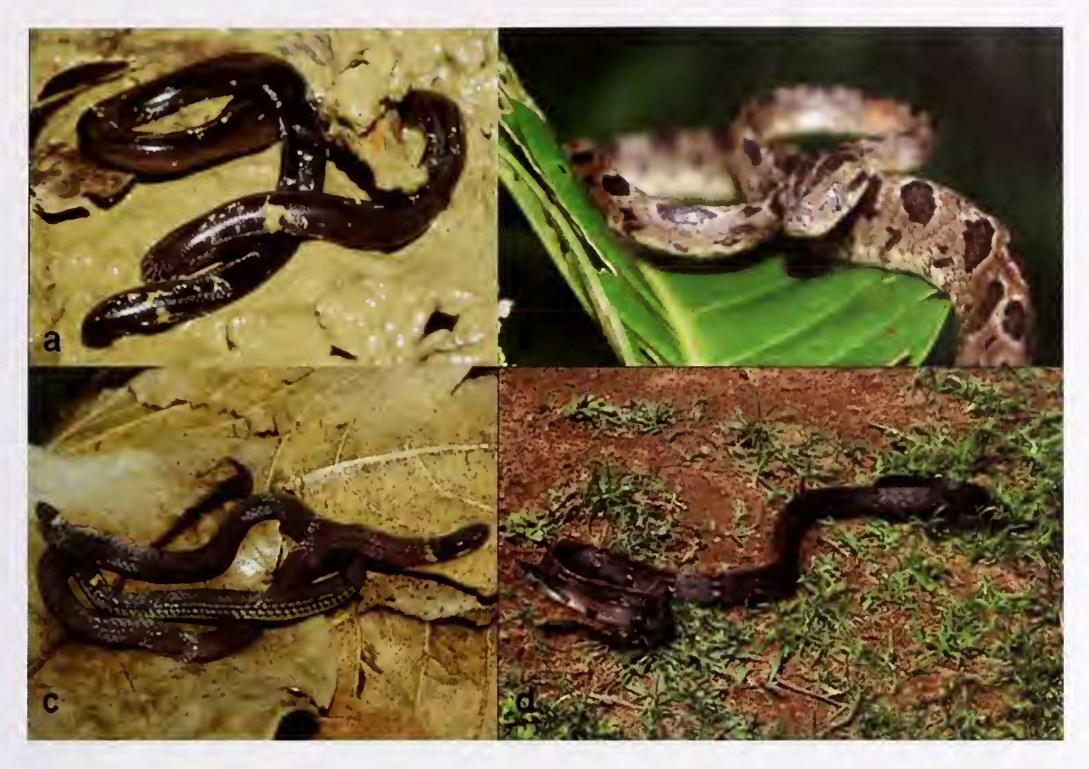
Fig. 2. a. Typhlops siamensis (ZFMK 88922); b. Boiga multomaculata (ZFMK 88923); c. Calamaria pavimentata (ZFMK 88924); d. Coelognathus flavolineatus (ZFMK 88898).